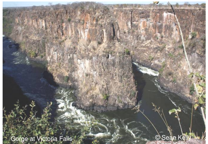
Gorge at Victoria Falls