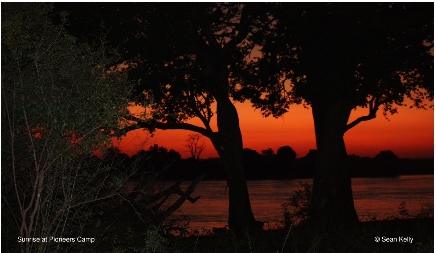
Sunrise at Pioneers Camp